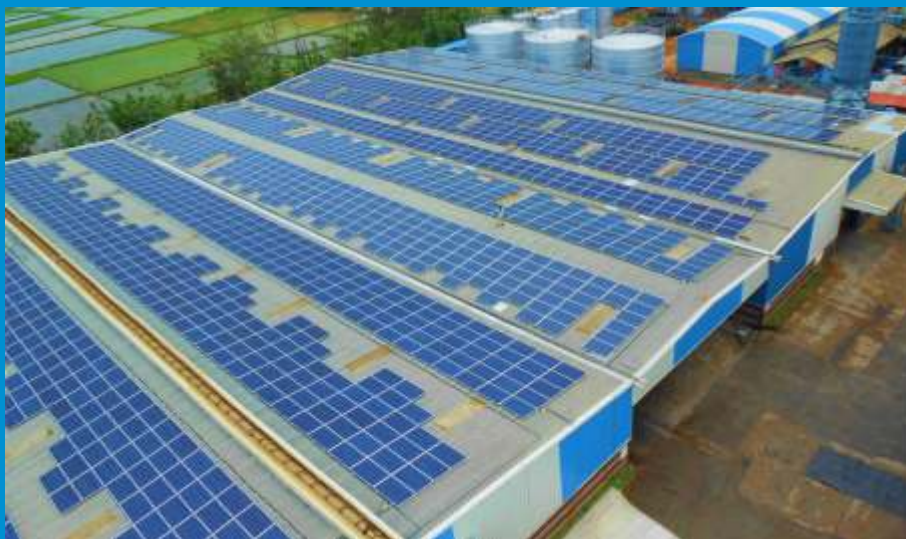
500 kilowatt rooftop project installed by Orb

*Specifications are subject to change without notice