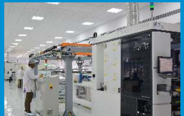
In-house manufacturing facility